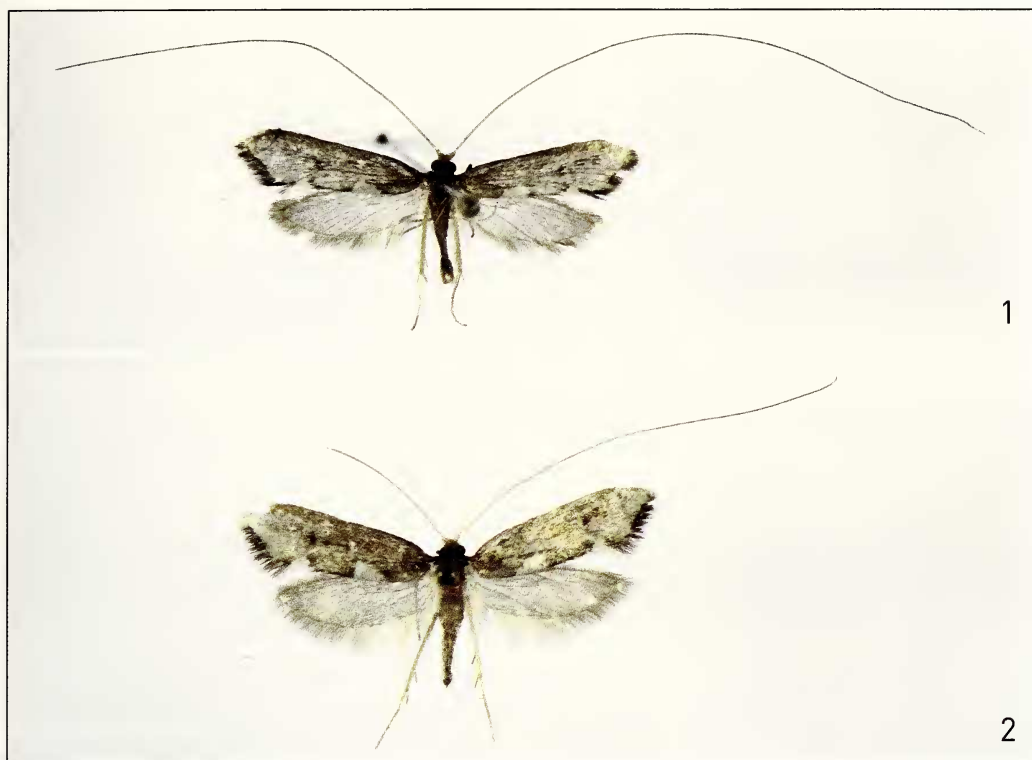
Figs 1, 2. Nematopogon stenochlora . 1. female, Spain, prov. Malaga, Marbella, El Mirador, 3.ii.1984; 2. male, Spain, prov. Malaga, Casares, 9.ii.2003.

and Spain); discal spot absent in light specimens (e.g. in syntypes) but present in dark specimens (e.g. those collected in Spain). Cilia from pale ochreous, indistinguishable from forewing colour (e.g. in syntypes) to dark brown, clearly contrasting to forewing background (e.g. in specimens collected in Spain). Light marks on dorsal margin of forewing greatly variable. The tornal mark is always present, although minor (a few scales) and almost indistinguishable in light specimens (e.g. in syntypes); however, even in these extreme situations the light colour of cilia marks its occurrence (this can be seen even in the paralectotype, see Nielsen 1985: 17, fig. 25). The proximal mark (located at approx. 1/3 of forewing length) is absent in most specimens from Algeria, although traces of it are present in two specimens from Constantine; in contrast, this mark is very distinct (reaching 0.15 \times forewing length and 0.20 \times forewing width) in specimens from Spain. Hindwing sparsely scaled, semi-translucent, from pale greyish to light brown. Legs light brown. Epiphysis at 0.3 , not reaching apex of tibia. Abdomen greyish brown.